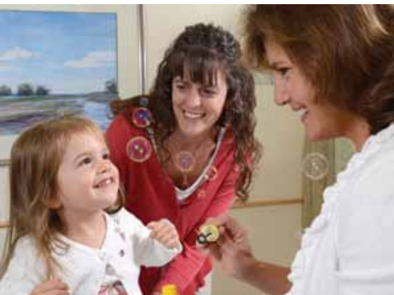
Left: Our patient advocate uses a "bubble break" to relieve a little one's anxiety.

The program is especially helpful for those who are newly diagnosed with a chronic disease – such as diabetes or hypertension – and need more support to understand and effectively manage their condition. (See Transitional Care, Page 2 )