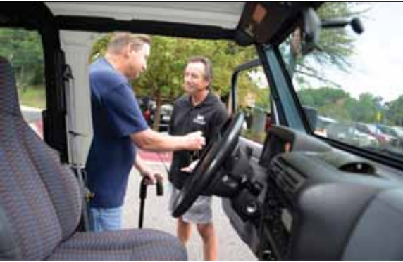
Above: With free valet parking, just drive up and give the attendant your keys.