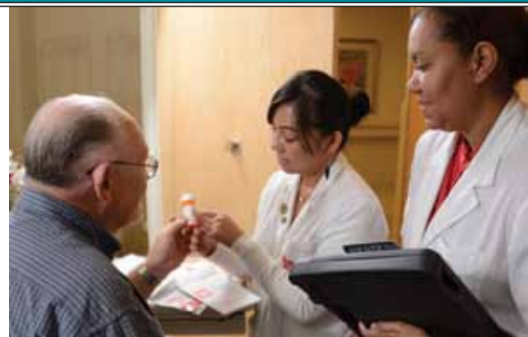
Above: Bedside medication delivery allows you to get your prescriptions before you go home.

Additionally, a host or hostess visits each patient twice a day – in the morning to select lunch and in the evening to order dinner and breakfast the next day. Together, they develop menu choices that satisfy the patient’s nutritional needs and suit his or